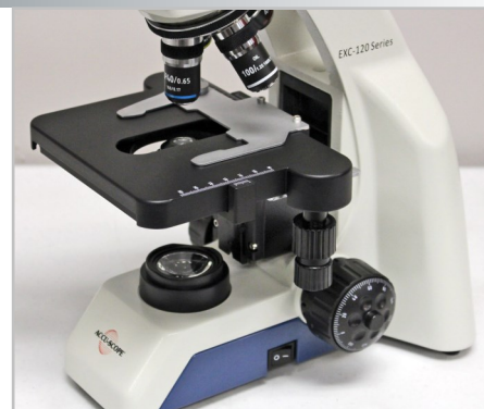
The stage size is 150mm x 139mm with a movement range of 75mm x 32mm

Design, features and specifications are subject to change without notice.