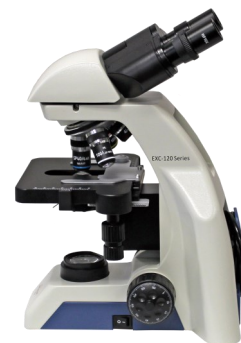
Viewing head rotates 360° for more compact storage