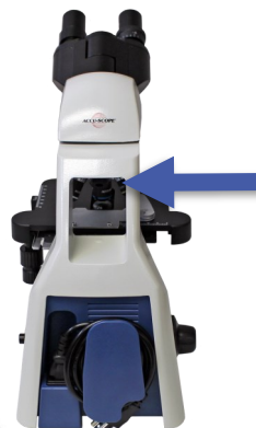
Integrated carry handle